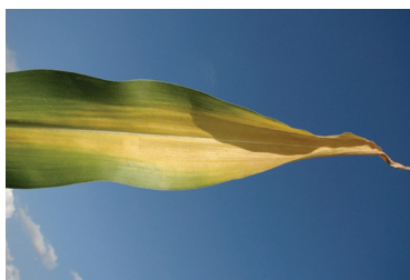
Nitrogen deficient corn leaf.