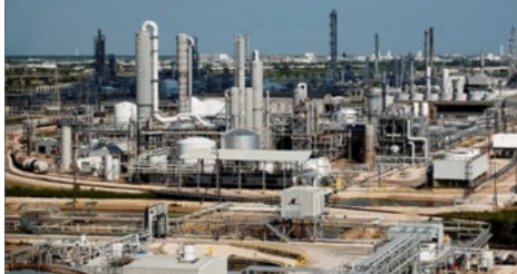
Yara International's joint venture with BASF, Freeport, Texas